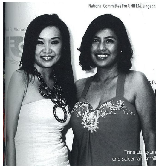
National Committee For UNIFEM, Singapore